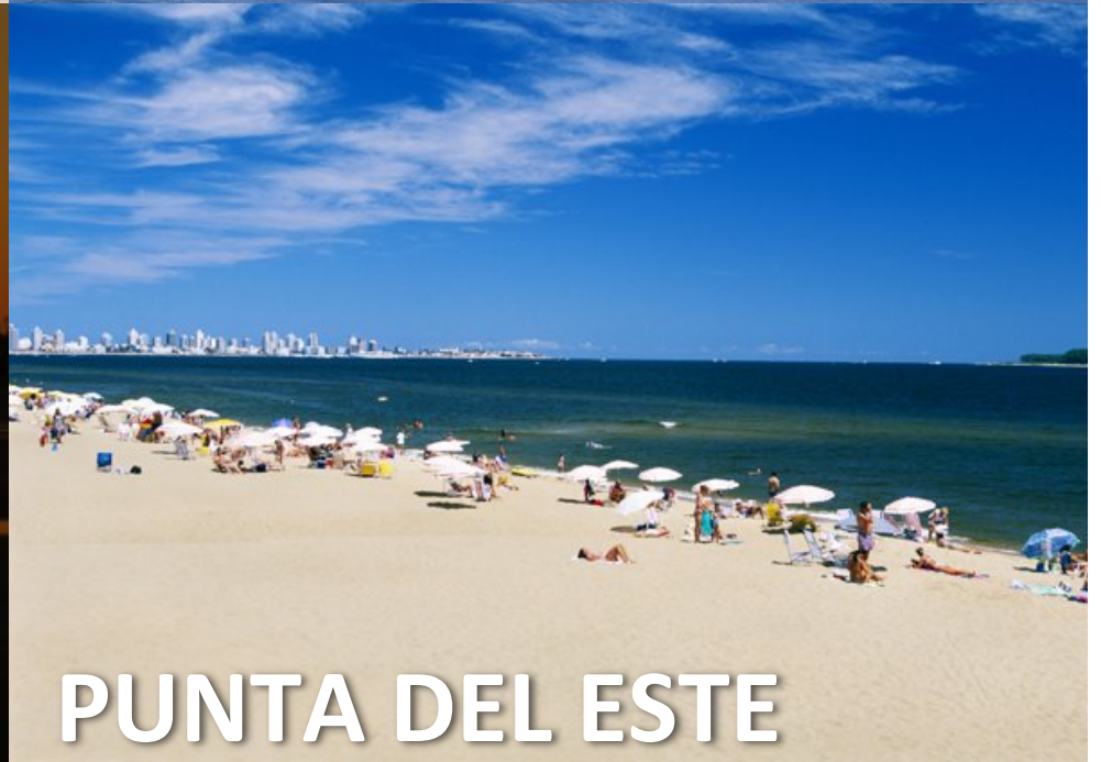
PUNTA DEL ESTE