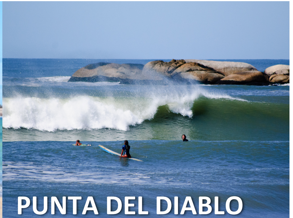
PUNTA DEL DIABLO